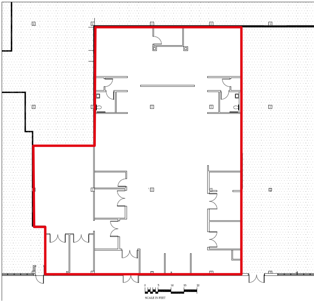
Suite #40 6,843 SF