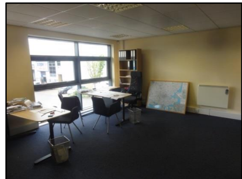
1 st floor office

Whilst these details are believed to be correct, their accuracy is not guaranteed. Interested parties must satisfy themselves with respect to all information provided. These details do not constitute, or form part of, an offer or a contract. Prices and rentals are subject to VAT where applicable.