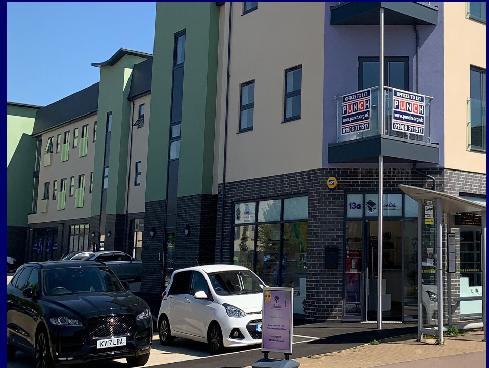
*Images are of CM8, which is fully trading. CM7 is a precise mirror image.

* Retail units 2&3 and 4&5 available can be combined to make two large units at approximately 1,851 sq ft each OR one large unit at 3,702 sq ft, dependant on tenants requirements.