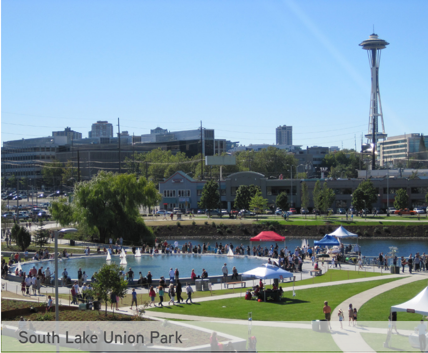
South Lake Union Park