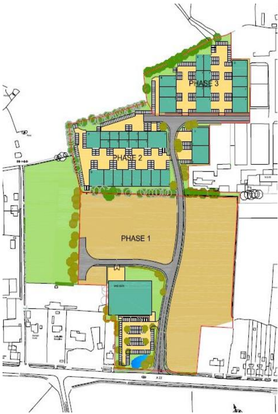
Indicative Scheme Layout