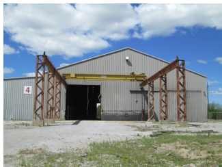
Exterior Lot Crane