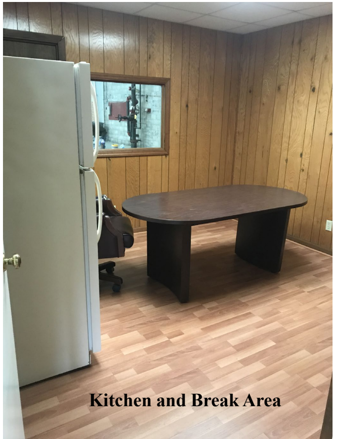
Kitchen and Break Area