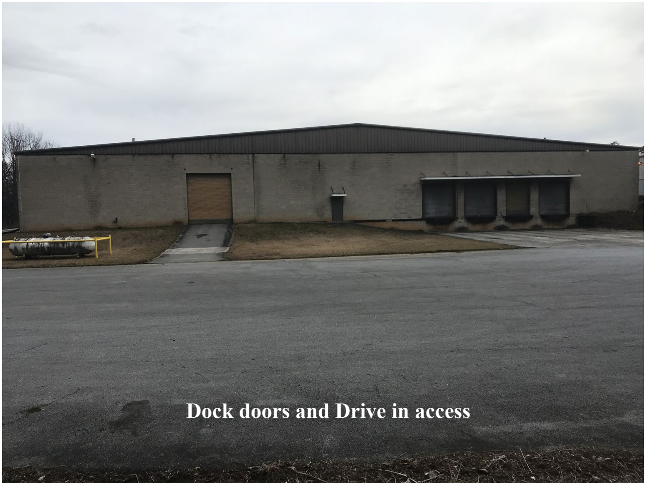
Dock doors and Drive in access