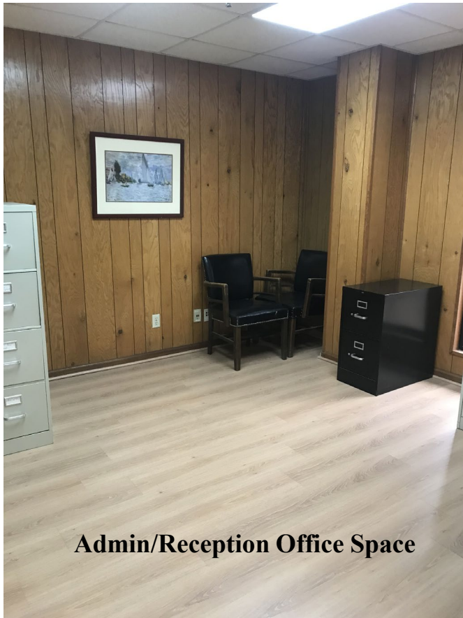
Admin/Reception Office Space