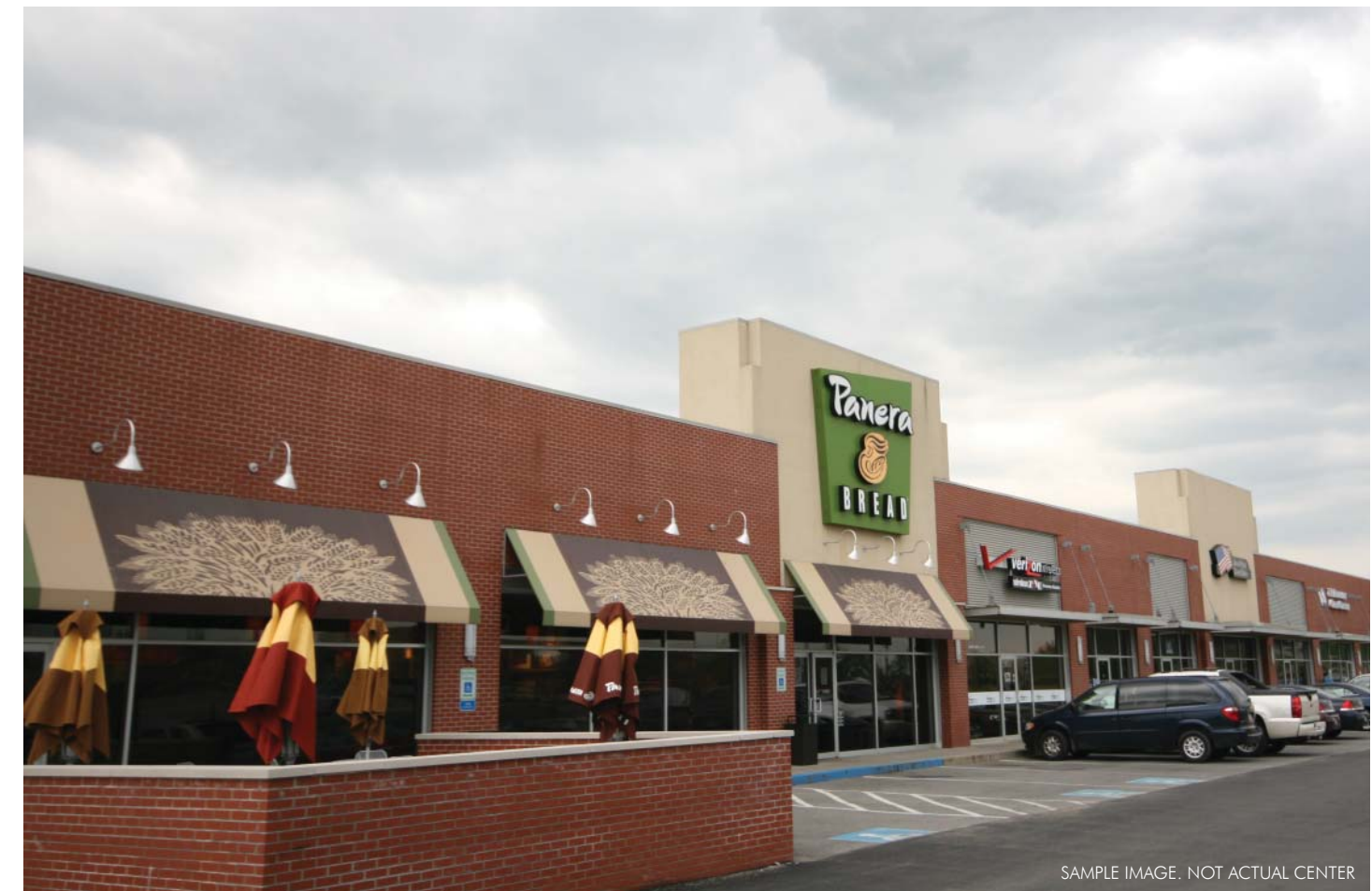
SAMPLE IMAGE. NOT ACTUAL CENTER