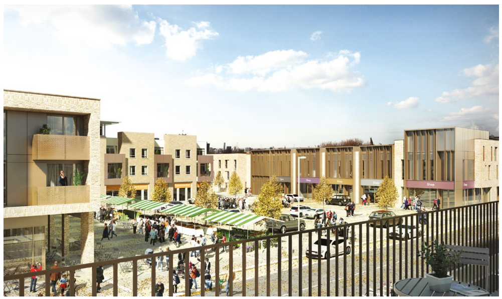
View from Fen Street

Other commercial uses will be considered subject to planning consent and application.