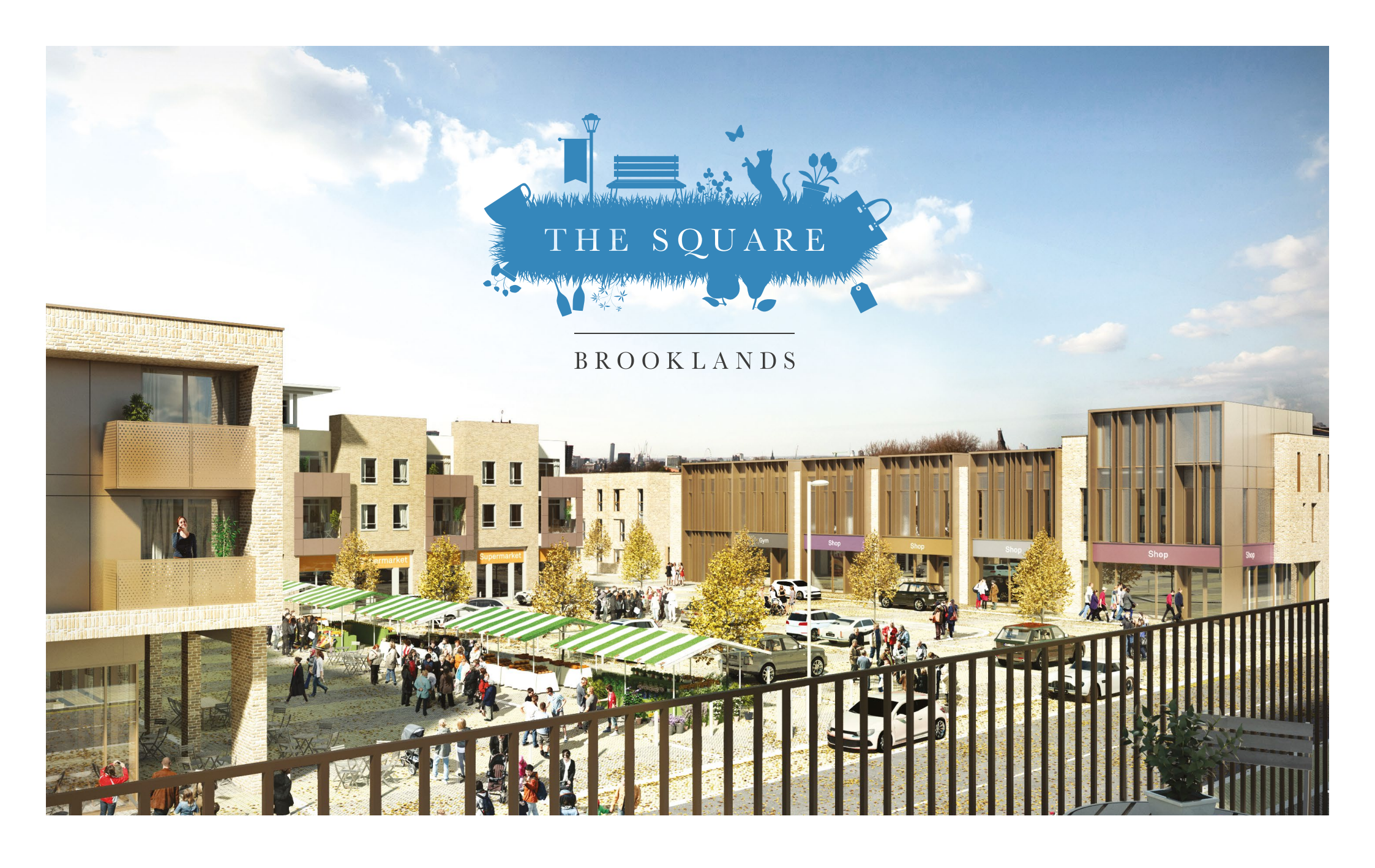
Brand new retail development in Milton Keynes coming Summer 2018