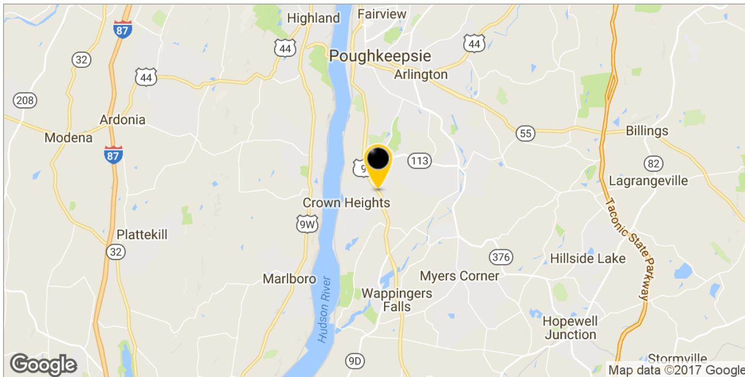
Map data ©2017 Google