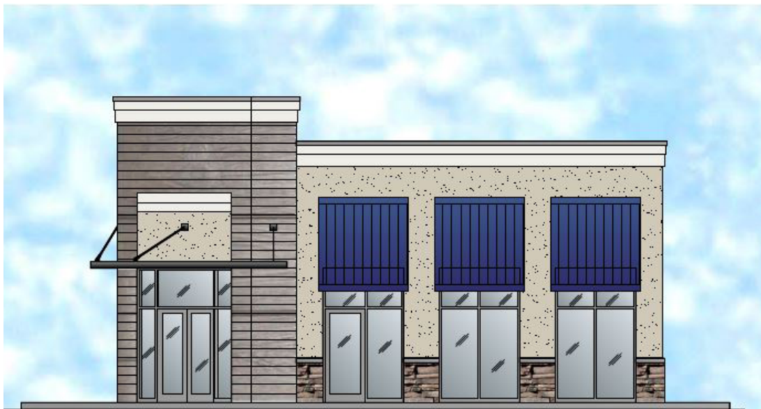
Michigan Street Rendering View