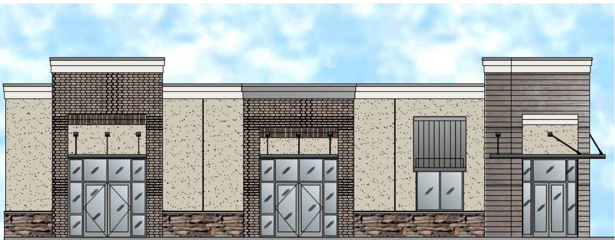
Orange Avenue Rendering View