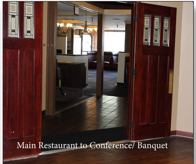
Main Restaurant to Conference/ Banquet