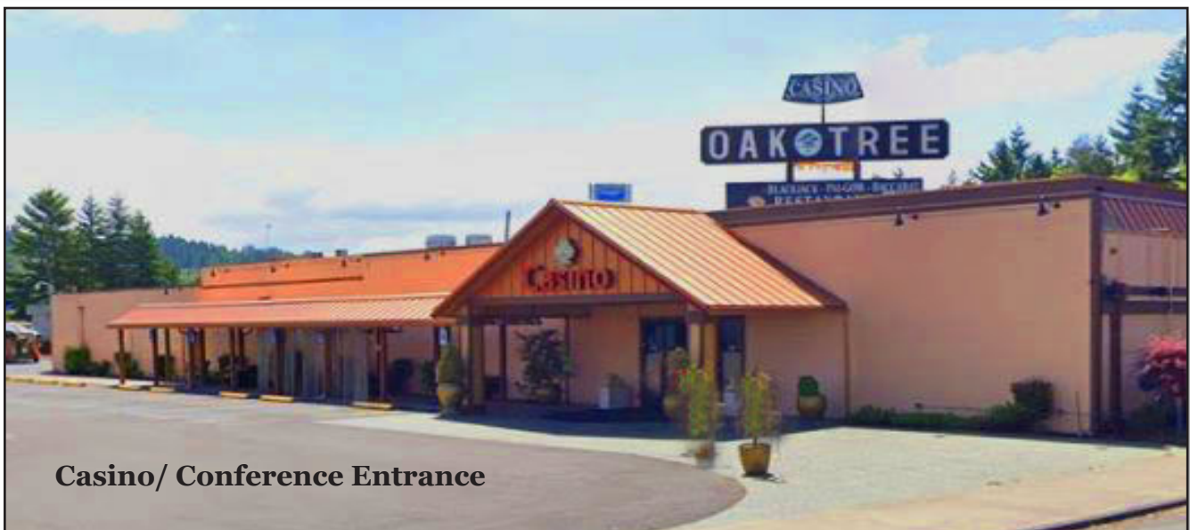
Casino/ Conference Entrance

The beautiful old Oak Tree out front is a memorable reminder of the many years this favorite location has been in the community.