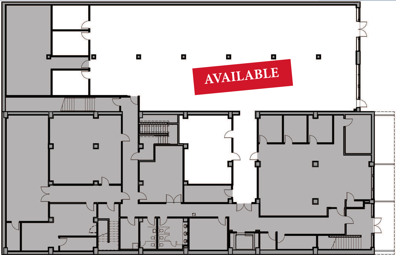
912 REGENCY PLAZA | Lower Level Floor Plan

For Lease 6,750 s.f. Office Suite 912 West Saint Germain St., St. Cloud 56301