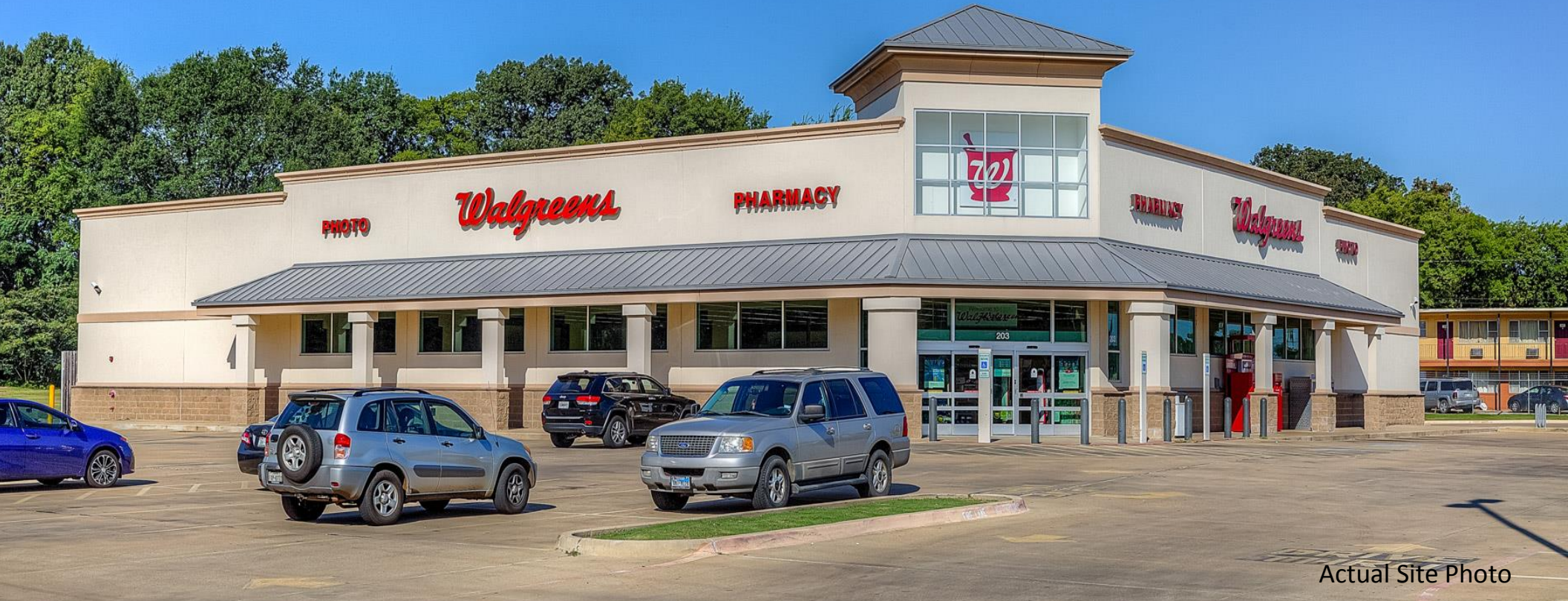
Actual Site Photo