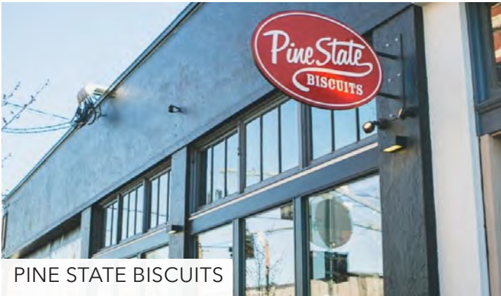
PINE STATE BISCUITS