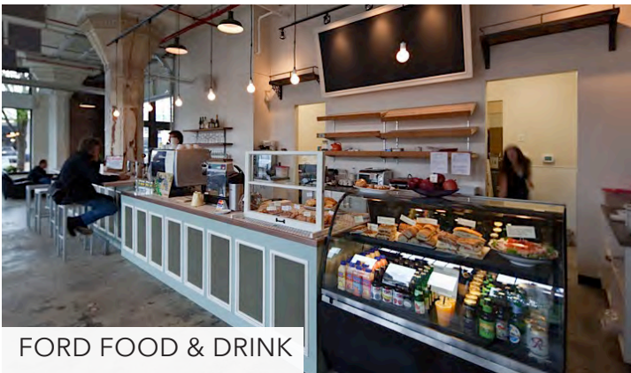
FORD FOOD & DRINK