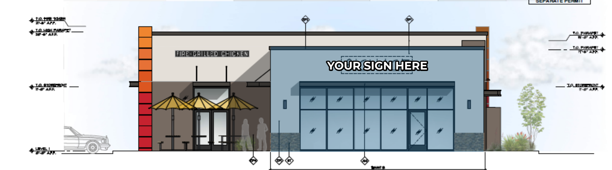
EAST ELEVATION - MAIN ENTRY