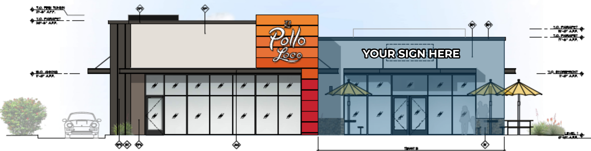
SOUTH ELEVATION - SIDE ENTRANCE