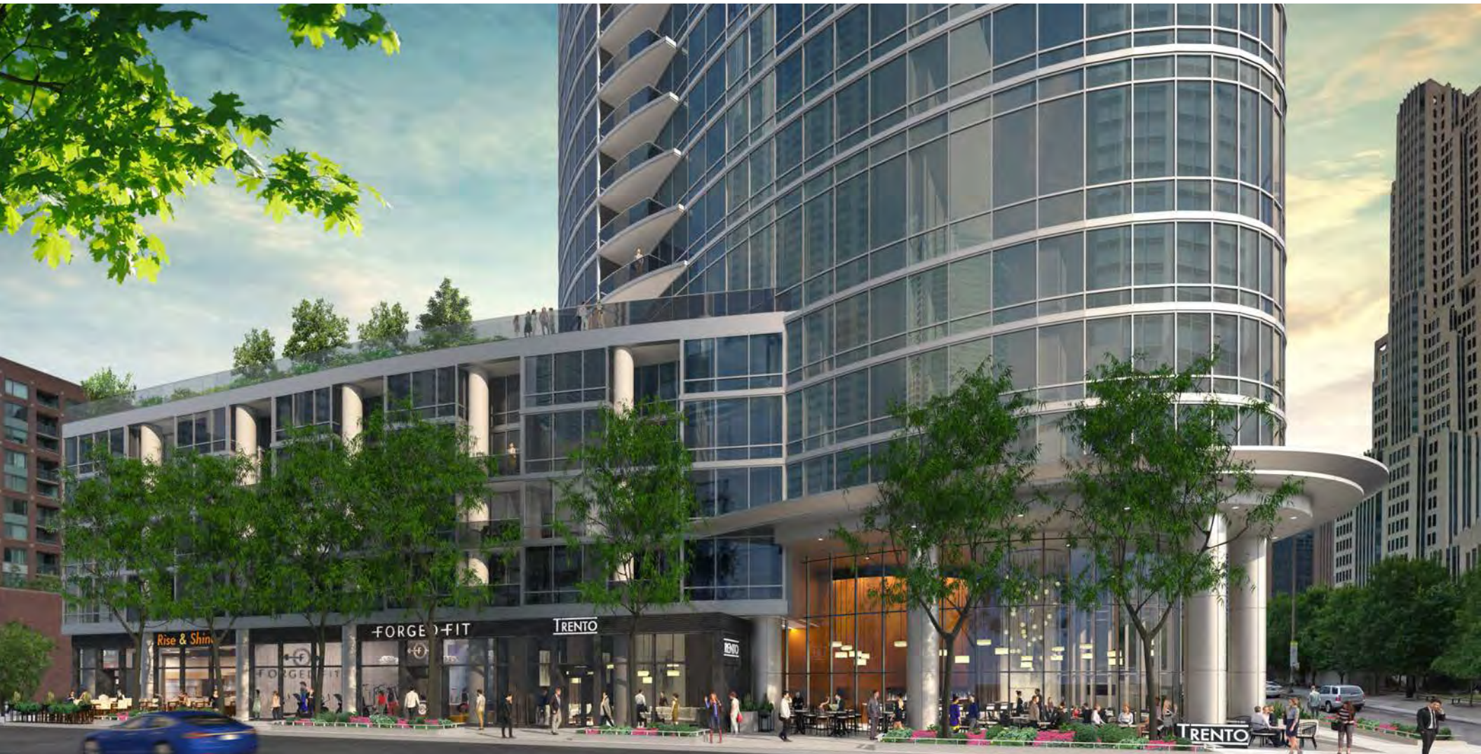
CONCEPTUAL RENDERING - SOUTH VIEW FROM EAST ILLINOIS STREET