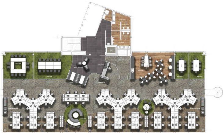
Indicative layout plan