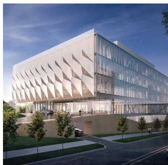
UC Gardner Neuroscience Institute

The UC Gardner Neuroscience Institute—a collaboration of the UC College of Medicine and UC Health—was founded in 1999 in a pioneering effort to bring clinicians and researchers into closer collaboration. Its $68 million, 114,000-square-foot, state-of-the-art headquarters will open in spring 2019. This new facility will bring together more than 125 internationally-recognized physicians and