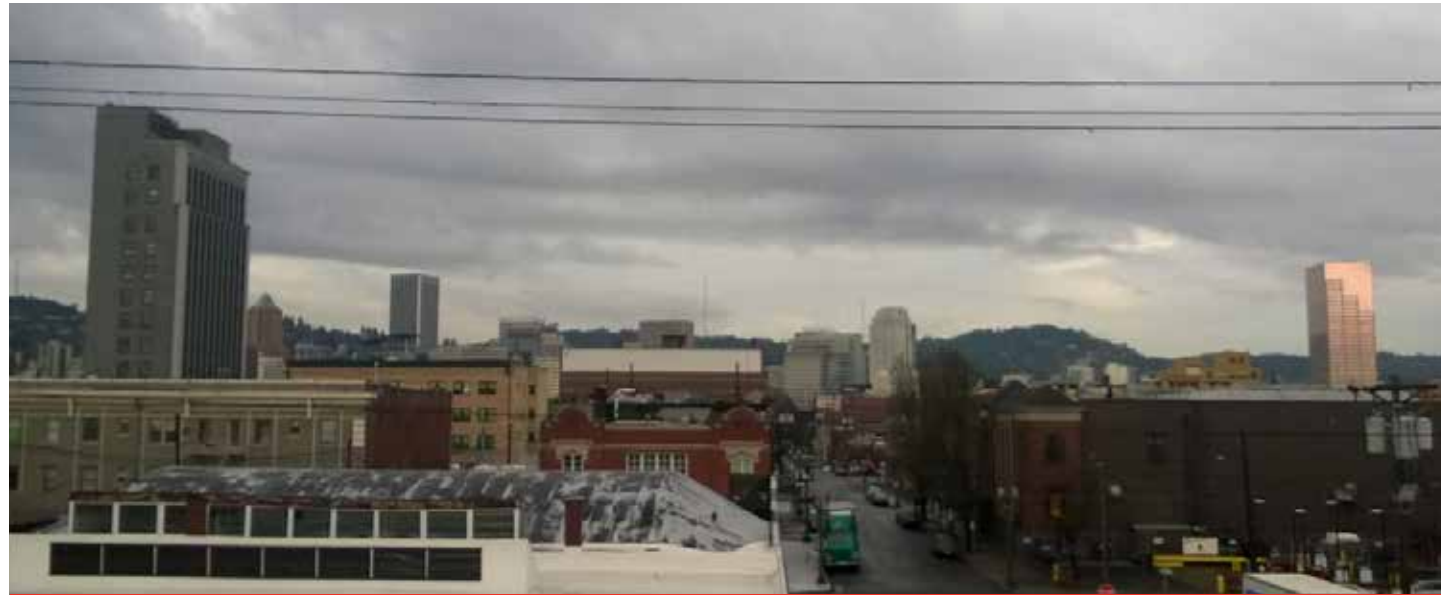
View from roof