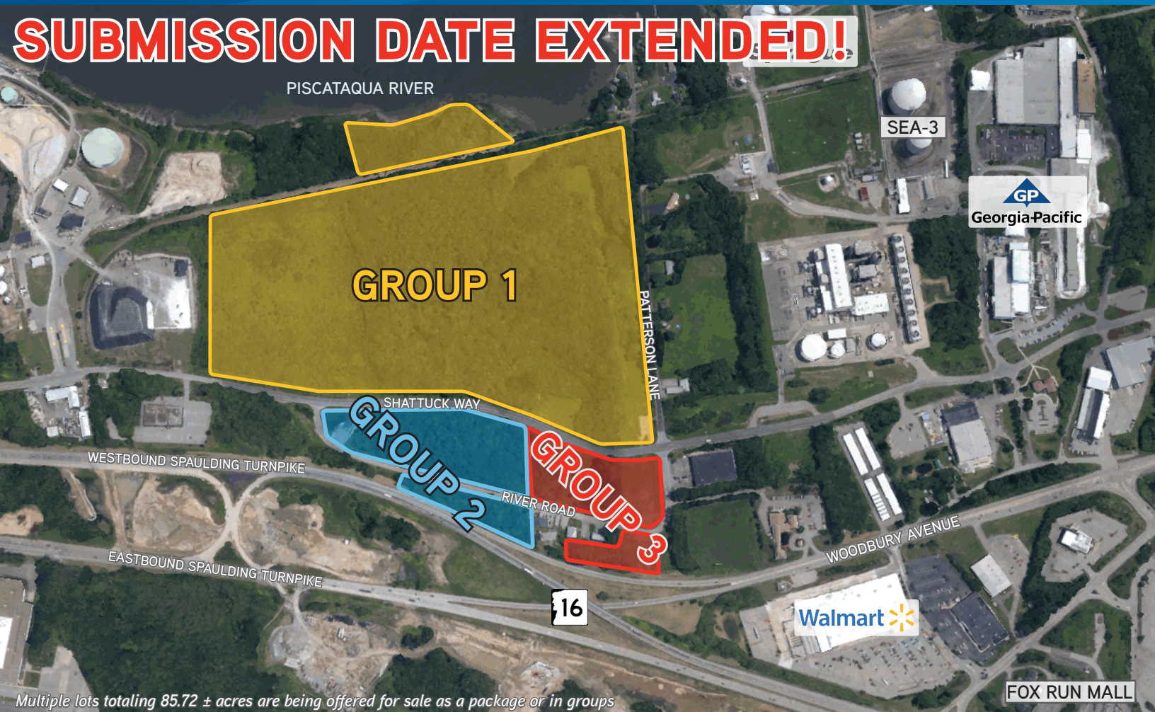
Multiple lots totaling 85.72 ± acres are being offered for sale as a package or in groups