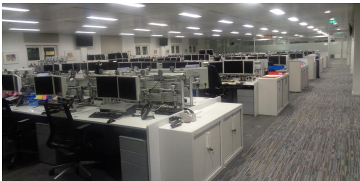
*Above illustrates open plan office space