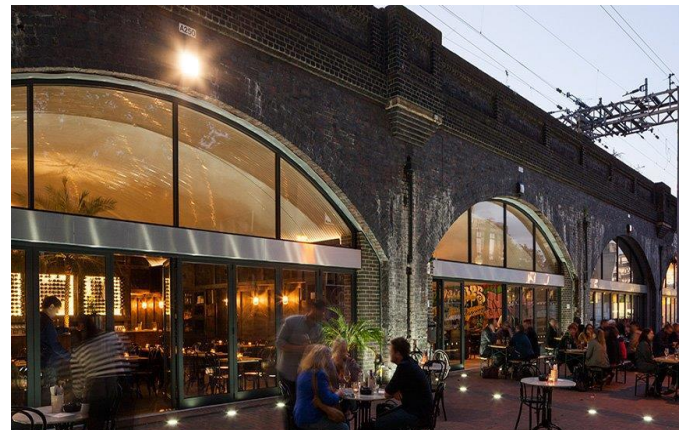
*Indicative image only

The properties are to be let on new effectively full repairing and insuring leases with five yearly upward-only rent reviews subject to standard Network Rail break clauses.