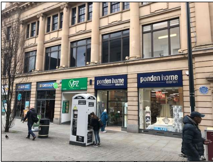
entrance of the Intu Derby Shopping Centre where there are multiple retailers located.

East Street links the Riverlights bus station with St Peters Street (Derby's main High Street) and provides a mixture of A1 (shops) and A2 (financial services). National occupiers nearby include Greggs, Thomas Cook, Lee Longlands, Poundland, TK Maxx and a number of financial institutions nearby.