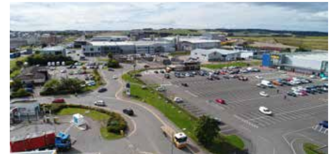
Location: Close proximity to numerous amenities