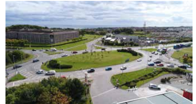
Transport links: Excellent access to southbound A90 and AWPR.