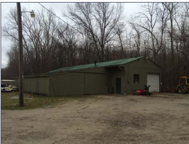
4,500 square foot maintenance building