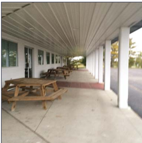
Banquet building porch area