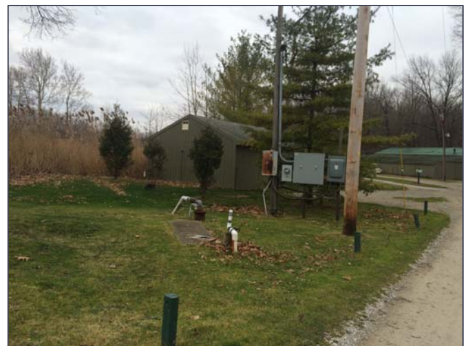
480 square foot pump house