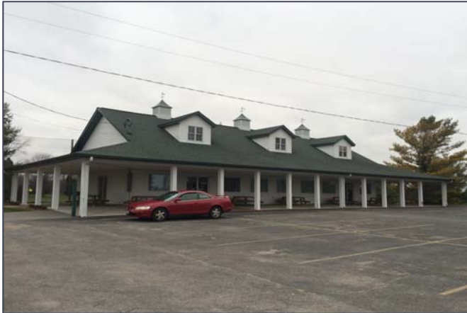
2,775 square foot banquet building