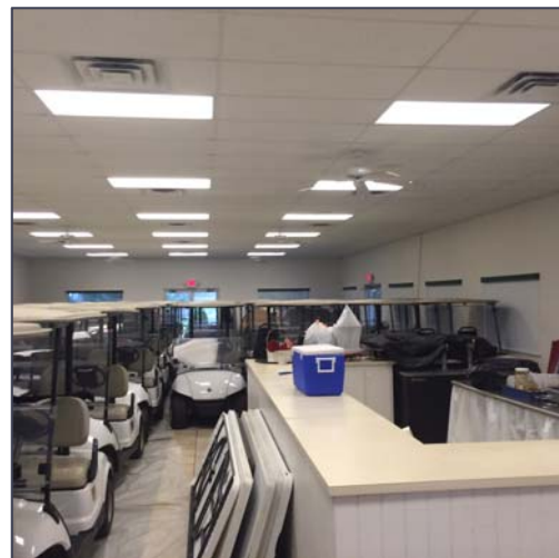
Banquet building beverage counter