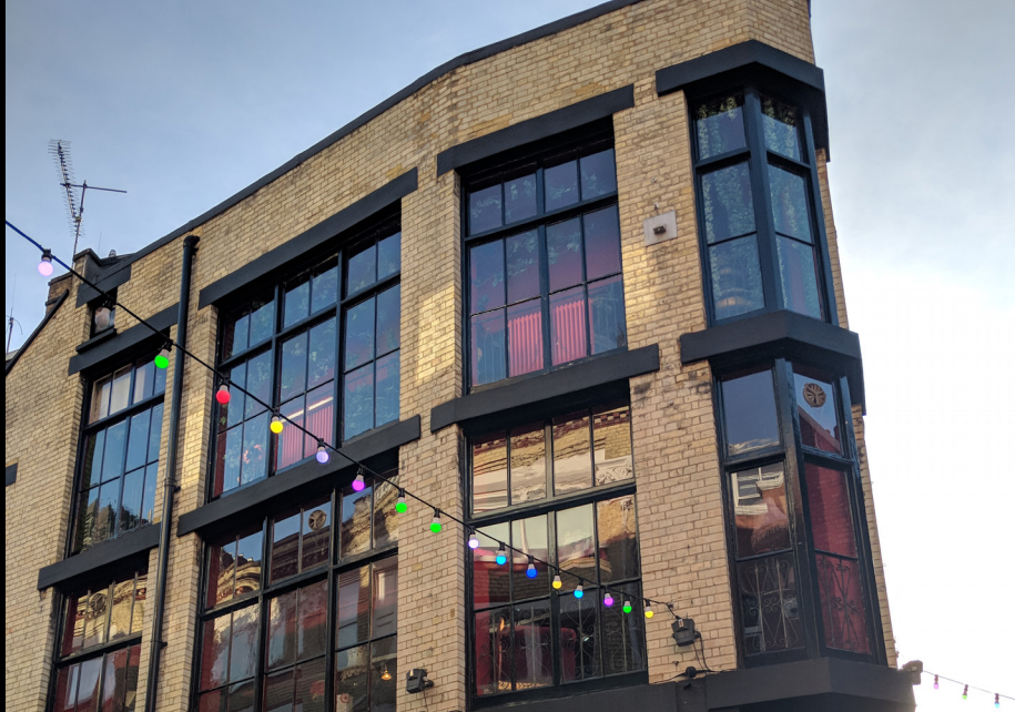
30-32 Foubert's place