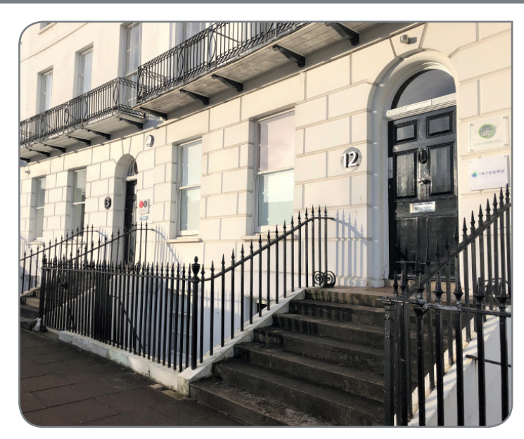
Other nearby occupiers include Cheltenham Borough Council, Hughes

Originally private homes, Royal Crescent is now formed largely of office occupiers who benefit from the close proximity to the Promenade and the High Street.