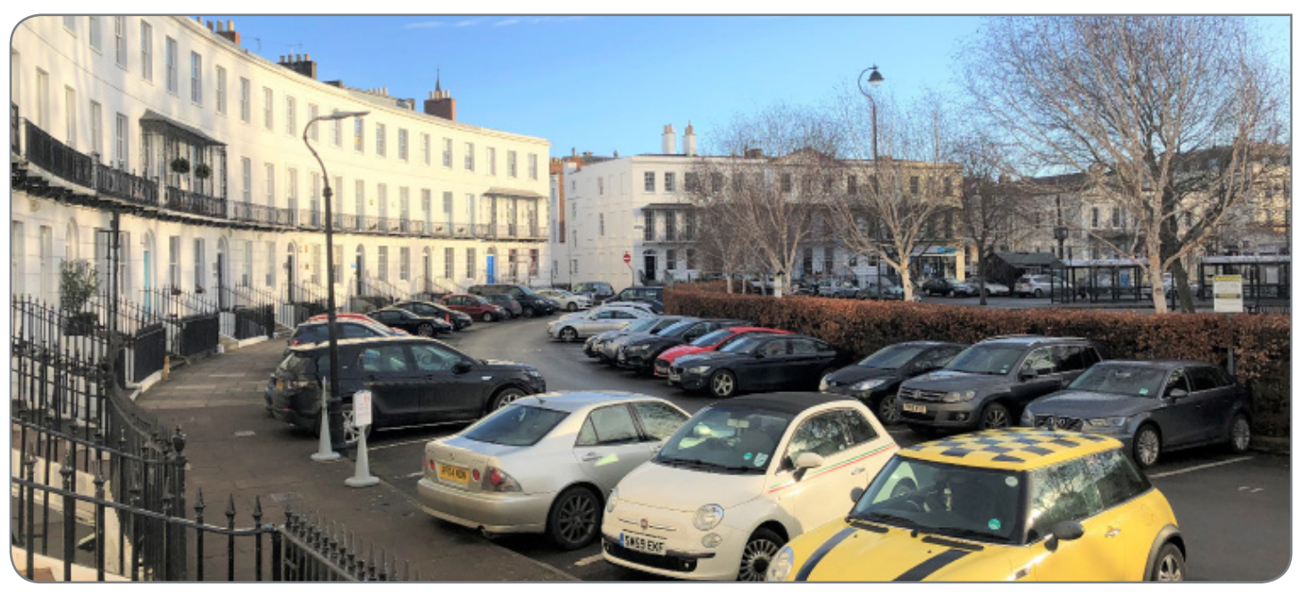
Paddison, Royal Crescent Surgery, Winston's Wish Charity and Star Legal.

Disclaimer: KBW Chartered Surveyors for themselves and for the clients of this property for whom they represent give notice that: a) the particulars are for guidance only and do not constitute an offer or contract. b) all descriptions, dimensions, areas, comments on condition and references to planning consents and permitted uses, and other details referred to are given without responsibility and intending purchasers or tenants should not rely on them as statements or representations of fact but must satisfy themselves as to their correctness by inspection or otherwise. c) no person employed by KBW Chartered Surveyors has any authority to make any representation of warranty whatsoever in relation to this property.