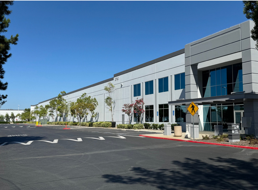
2760 Progress Street, Vista CA