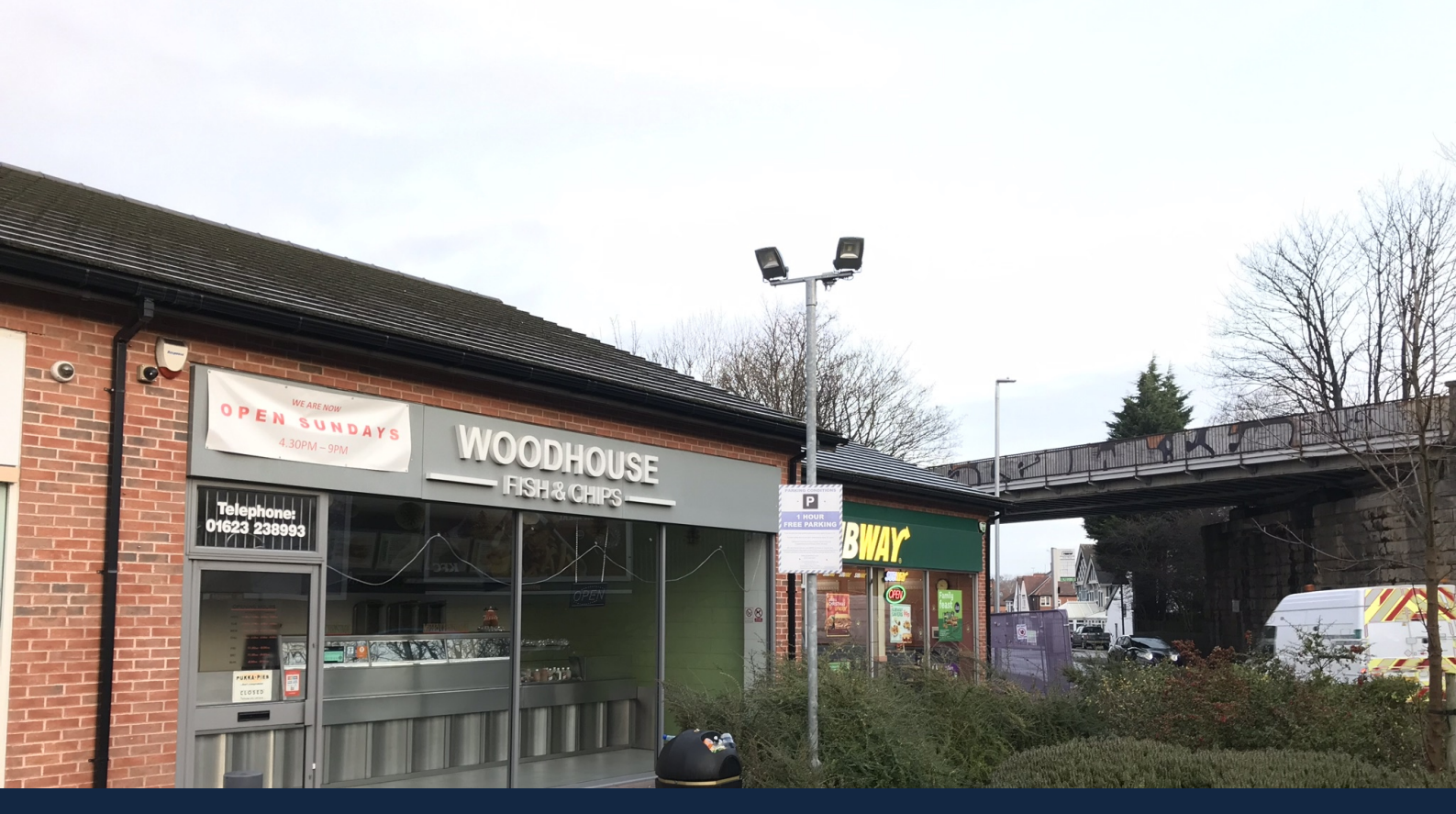
Unit 4, 69 Woodhouse Road, Mansfield, Nottinghamshire NG18 2BB