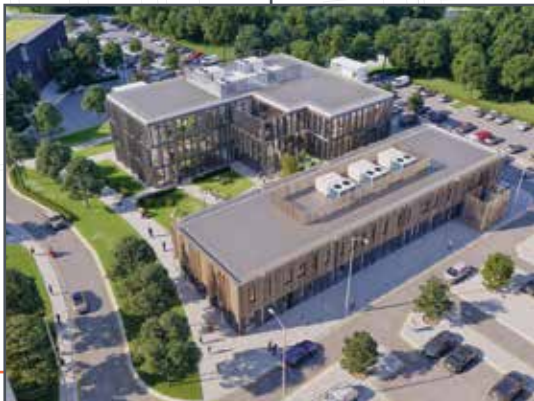
ANGLIA RUSKIN UNIVERSITY & 30,000 SQ FT OFFICE BUILDING NEXUS