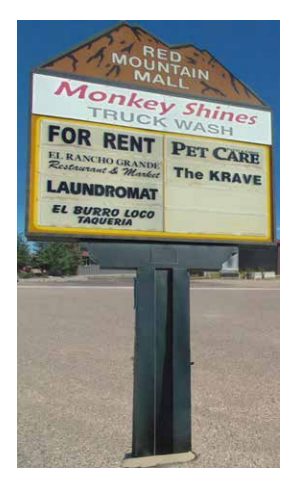
Pylon Signage Available