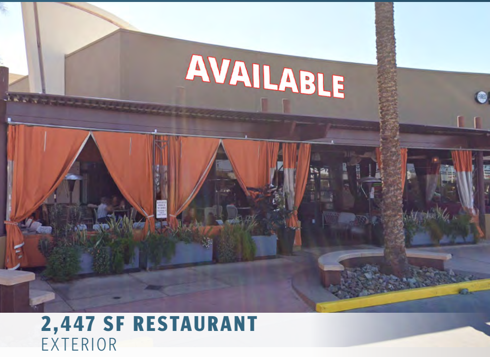
2,447 SF RESTAURANT EXTERIOR