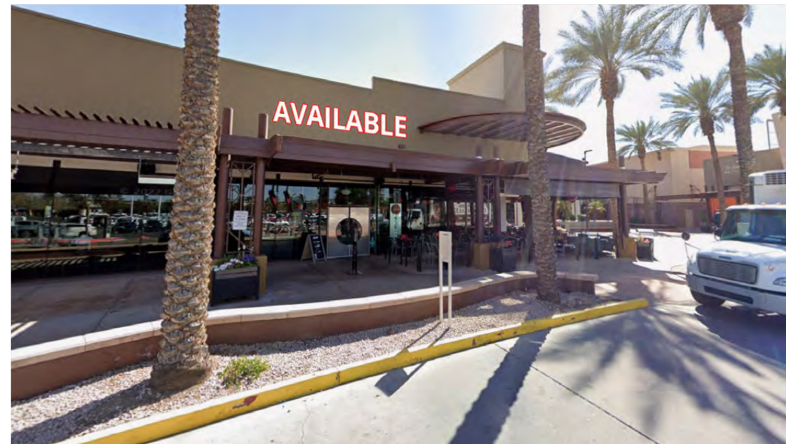
6,000 SF FORMER RESTAURANT EXTERIOR