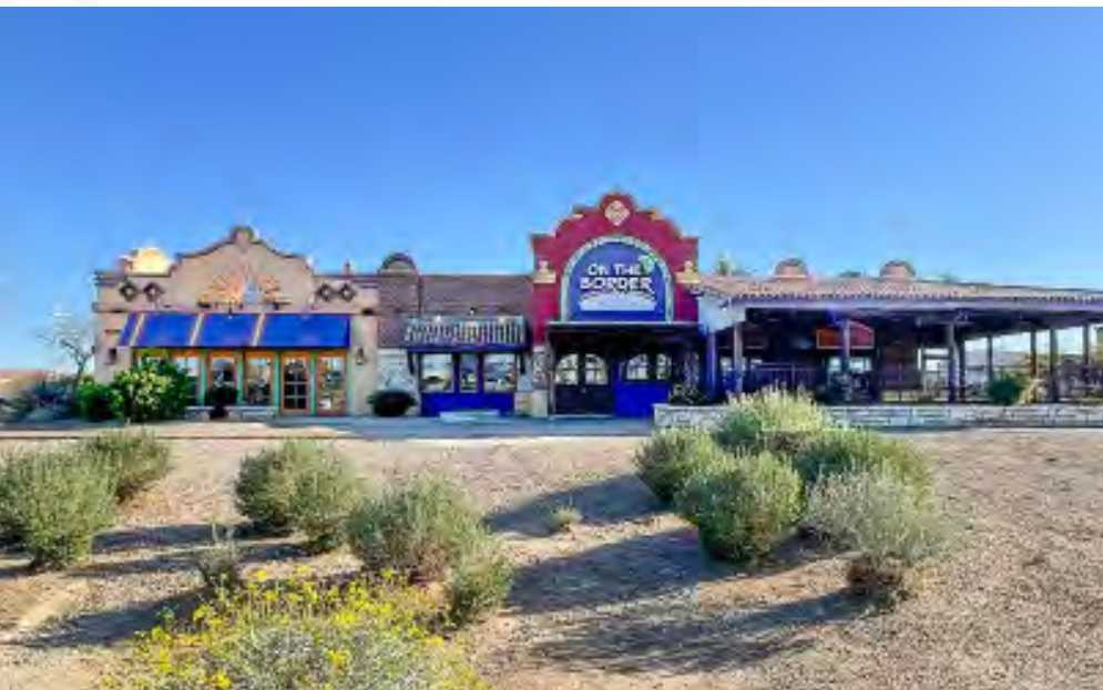
7,846 SF FORMER RESTAURANT EXTERIOR