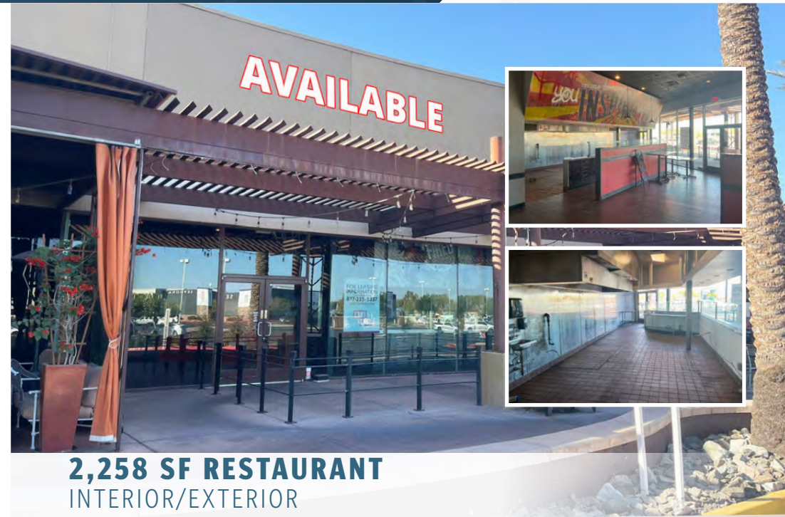
2,258 SF RESTAURANT INTERIOR/EXTERIOR