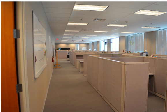
Open Workstation Area