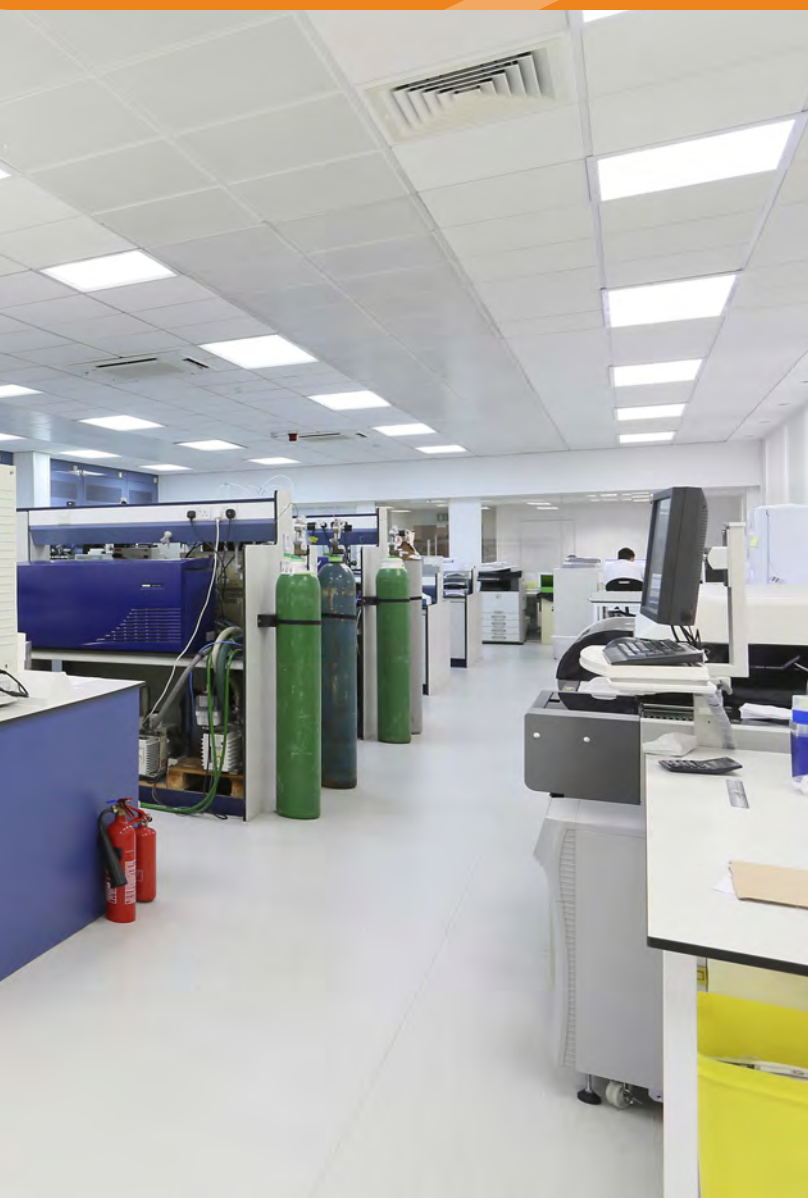
Specialist laboratory provision

“ A GOOD LOCATION, AN ONSITE GYM, CANTEEN AND CAR PARKING FACILITIES, MAKE IT AN IDEAL LOCATION FOR OUR BUSINESS AND OUR EMPLOYEES. ” TRIMEGA LABORATORIES