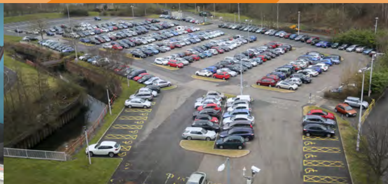
500 car parking bays

“ A GOOD LOCATION, AN ONSITE GYM, CANTEEN AND CAR PARKING FACILITIES, MAKE IT AN IDEAL LOCATION FOR OUR BUSINESS AND OUR EMPLOYEES. ” TRIMEGA LABORATORIES