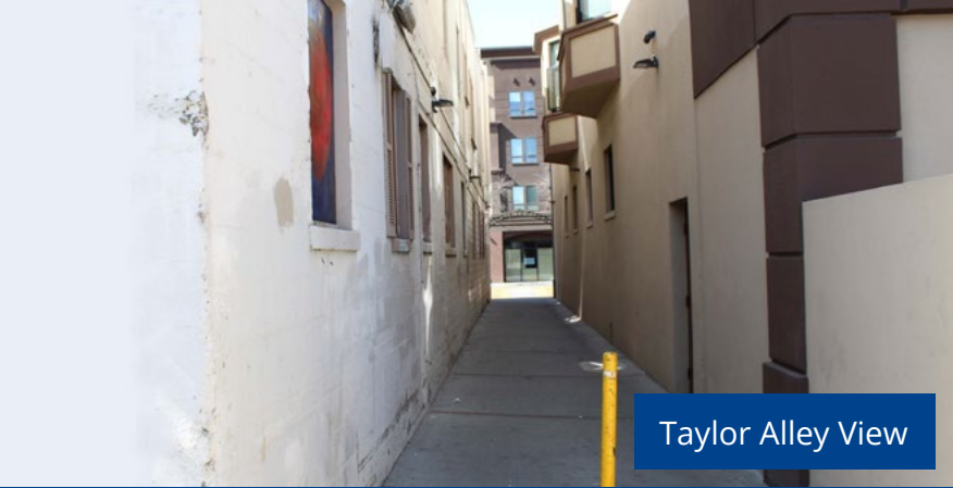
Taylor Alley View