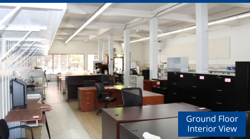
Ground Floor Interior View