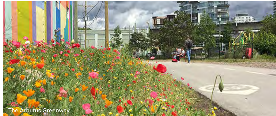
The Arbutus Greenway