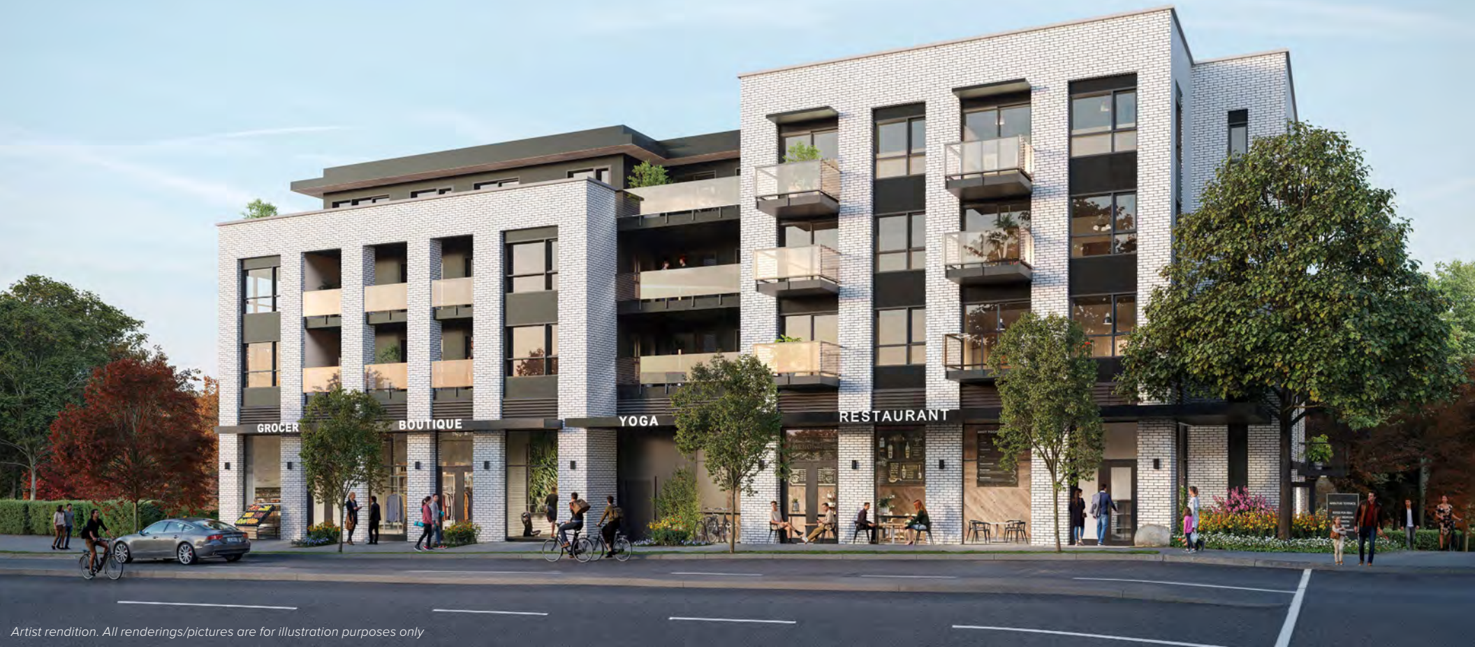
Artist rendition. All renderings/pictures are for illustration purposes only