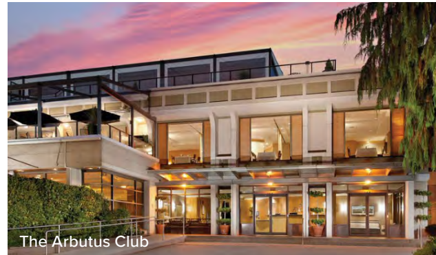
The Arbutus Club