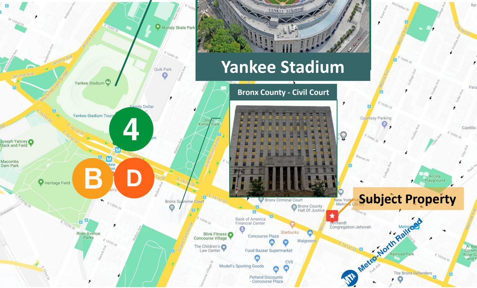
Bronx County - Civil Court