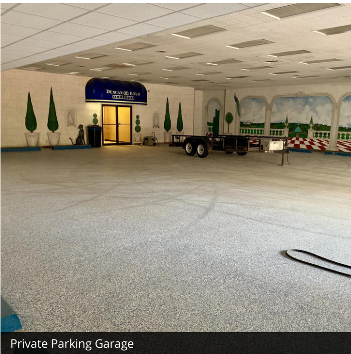
Private Parking Garage