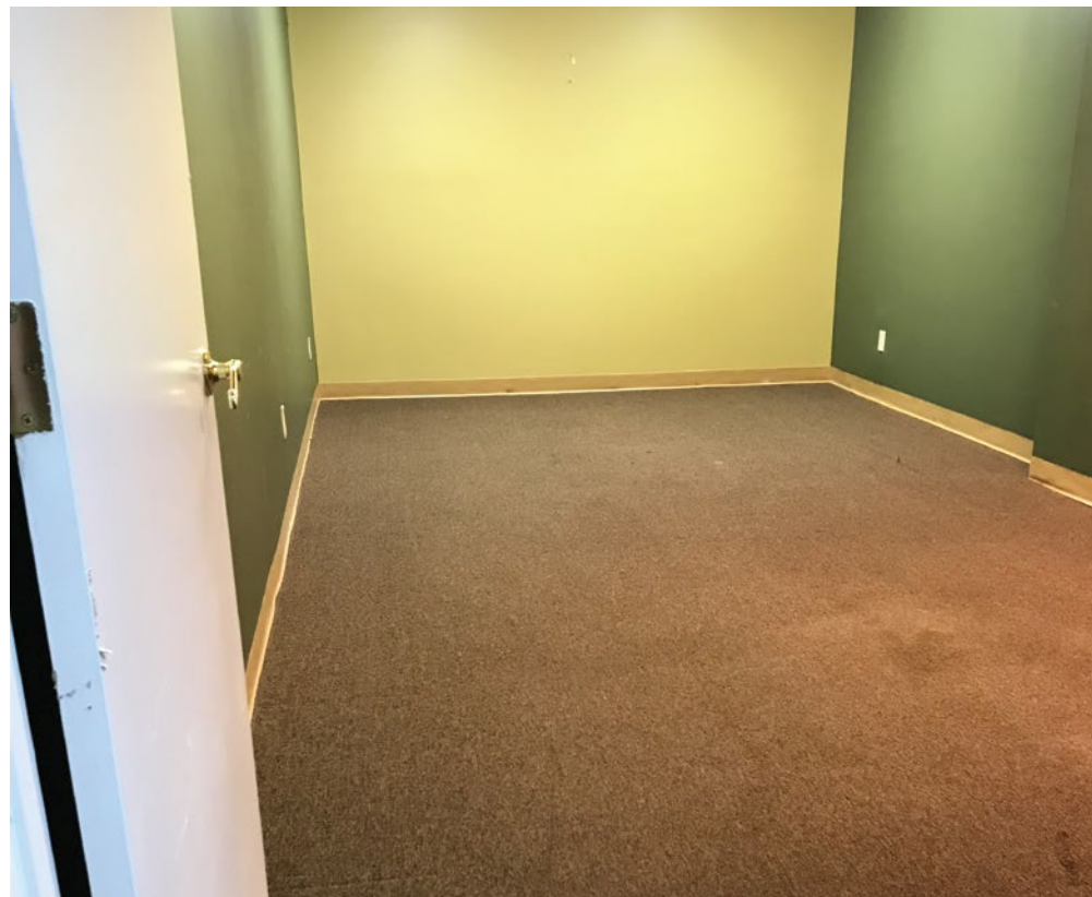
Office or Meeting Room