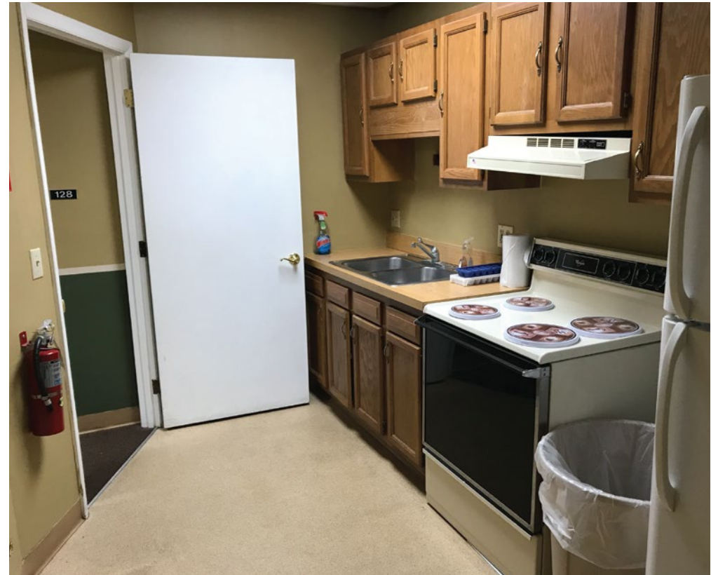
Employee Kitchen & Break Area