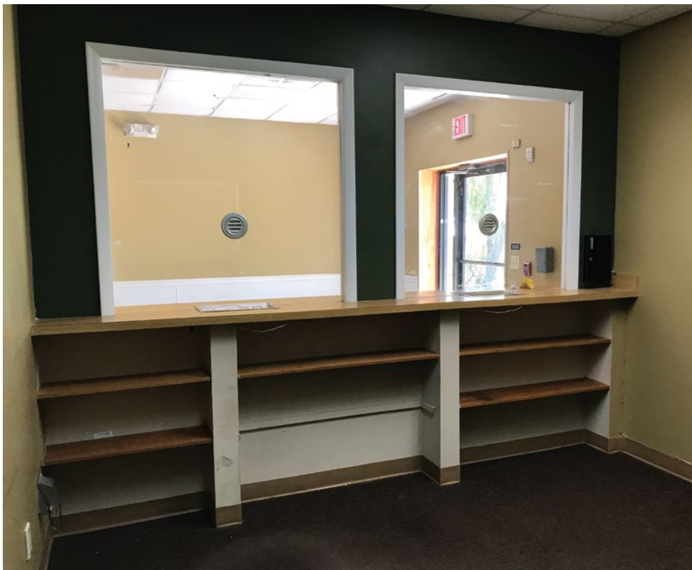
Office looking into Customer Entrance