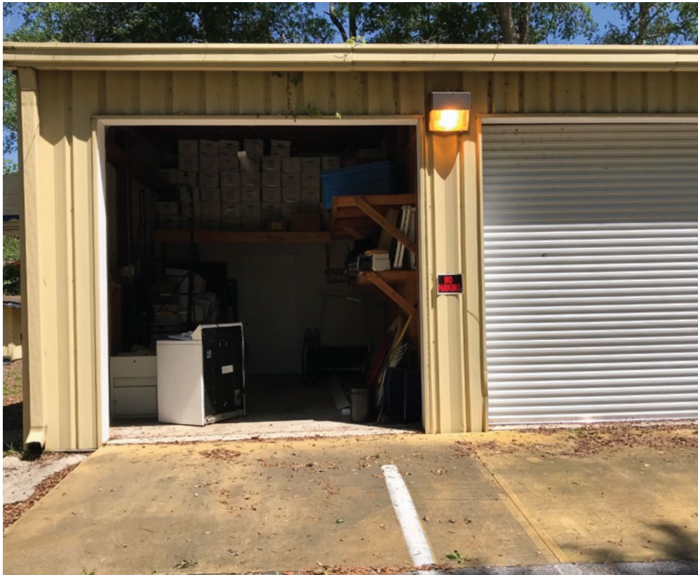
Storage space with Electric Overhead Doors