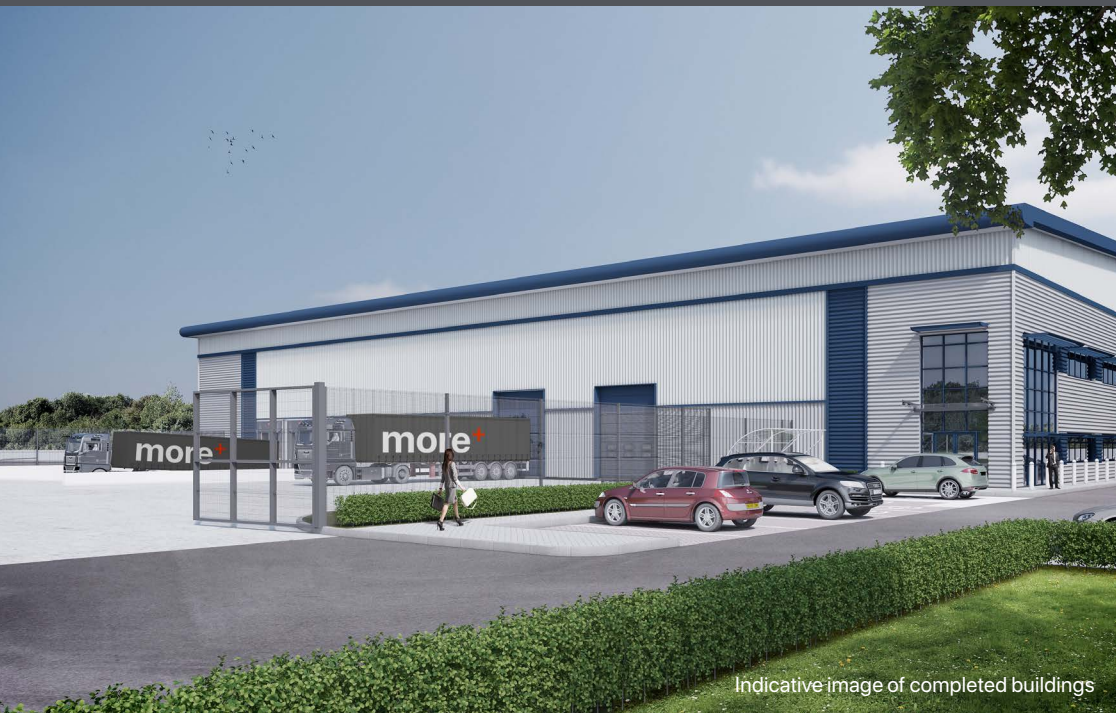
Indicative image of completed buildings

A brand new detached distribution unit with secure yard on the South West's Premier Distribution Park