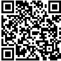
Virtual Tour Suite B