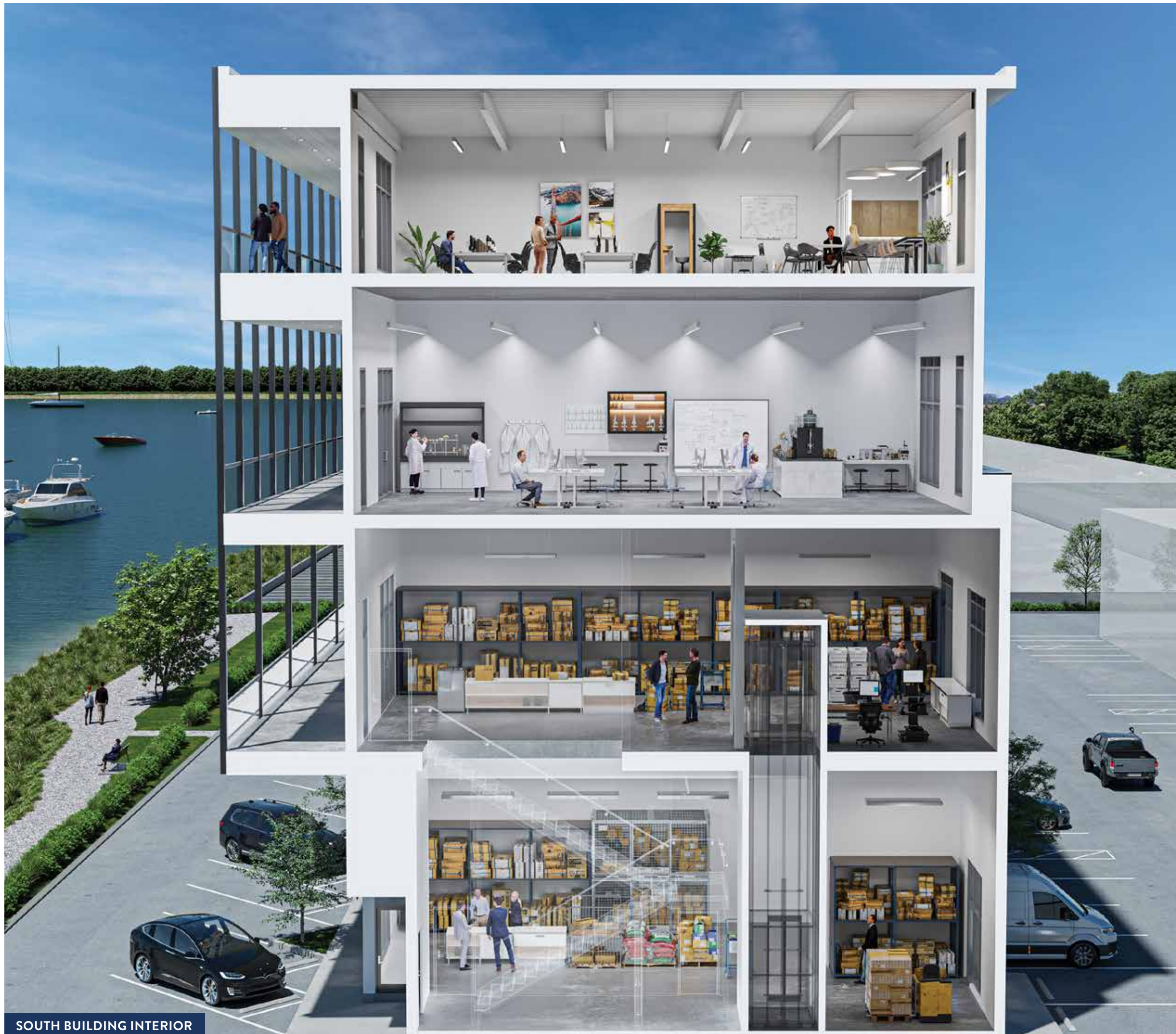
SOUTH BUILDING INTERIOR