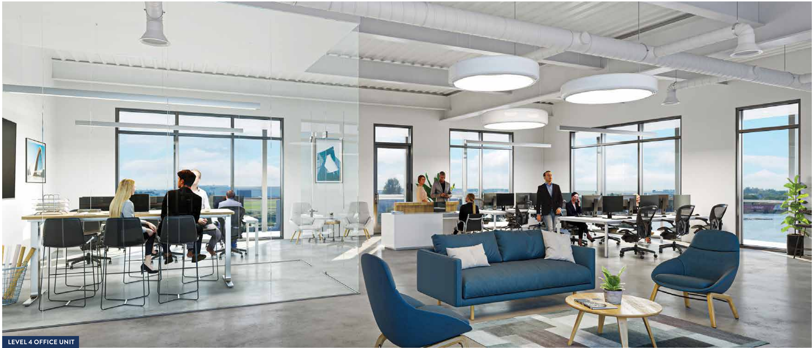
LEVEL 4 OFFICE UNIT