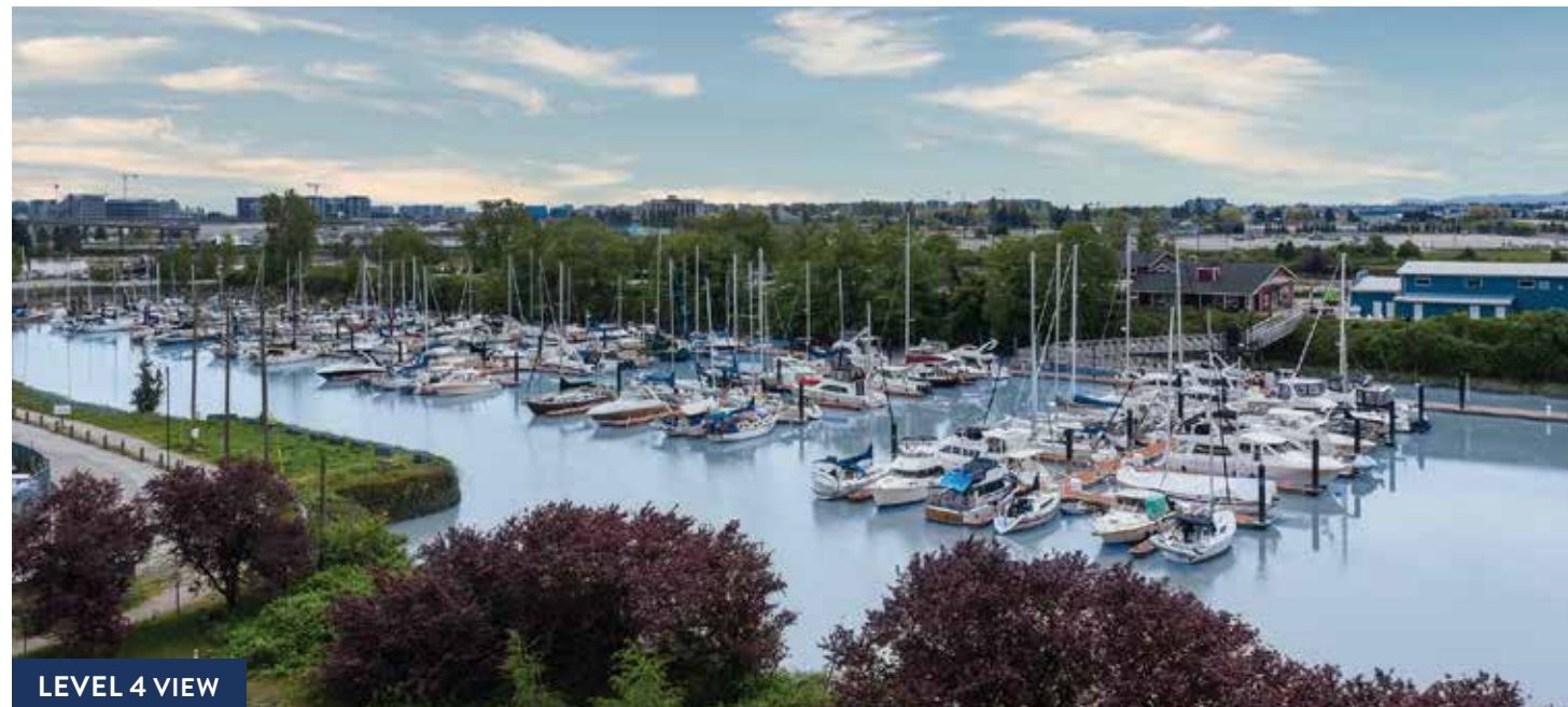
LEVEL 4 VIEW