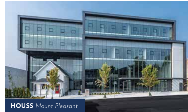
HOUSS Mount Pleasant

Capital investments bring long-term value, operating and mortgage interest expenses can be written off, and capital cost allowances provide tax savings.