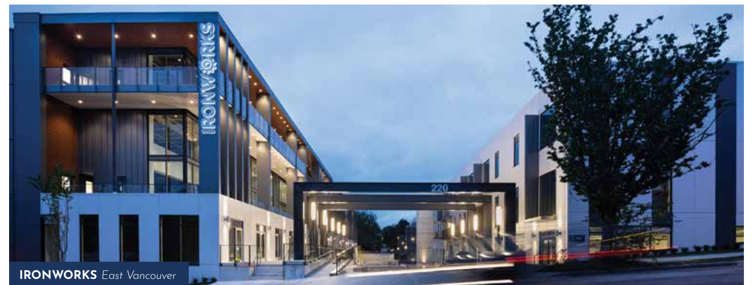
IRONWORKS East Vancouver

Conwest's reputation as a leader in the stacked industrial design movement began with the award-winning Ironworks , Canada's first stacked office and commercial industrial project. Occupying an entire city block in Vancouver's historically industrial Port Town