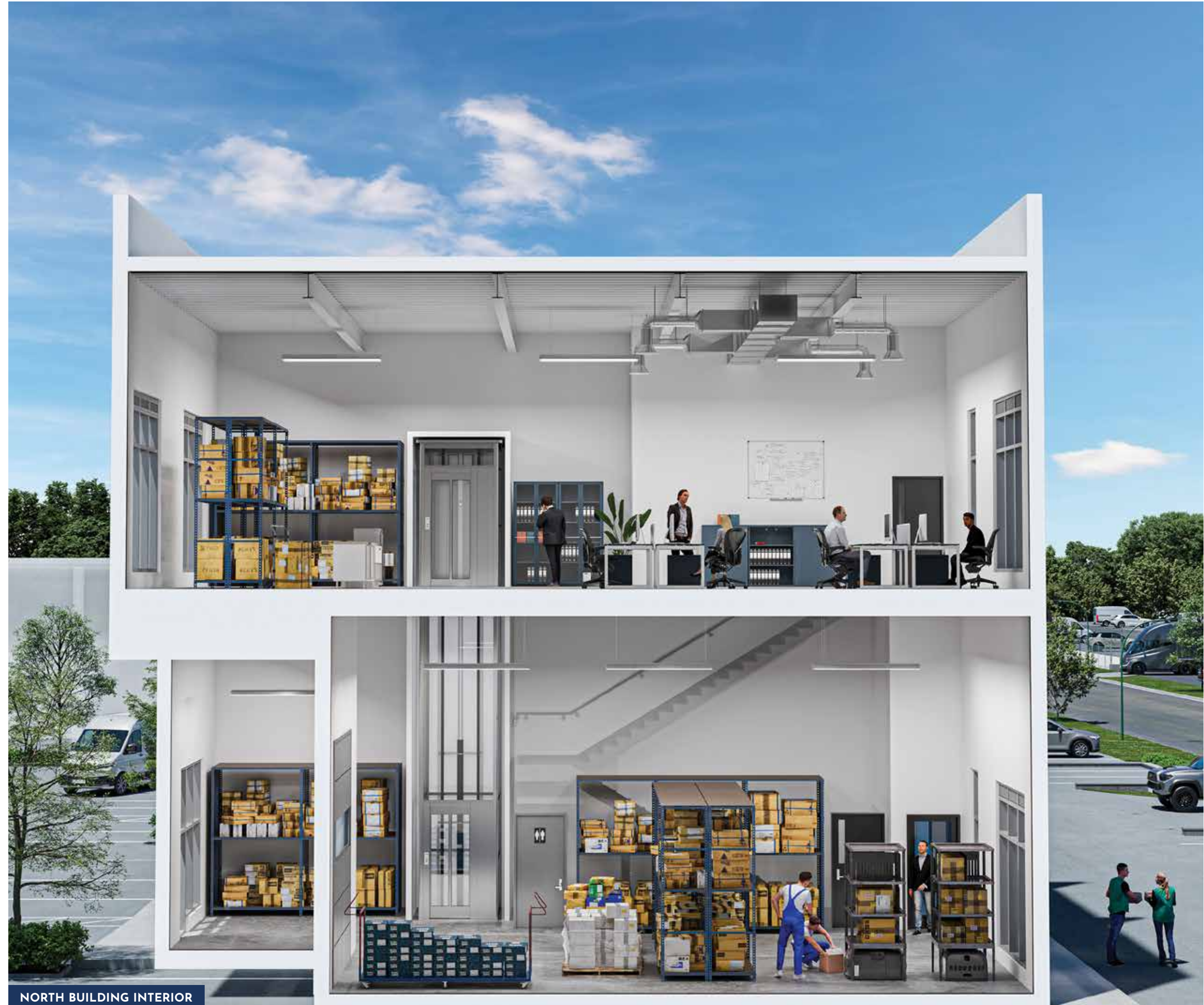
NORTH BUILDING INTERIOR