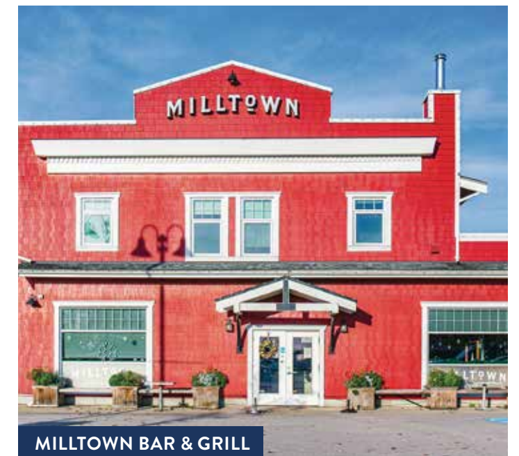
MILLTOWN BAR & GRILL