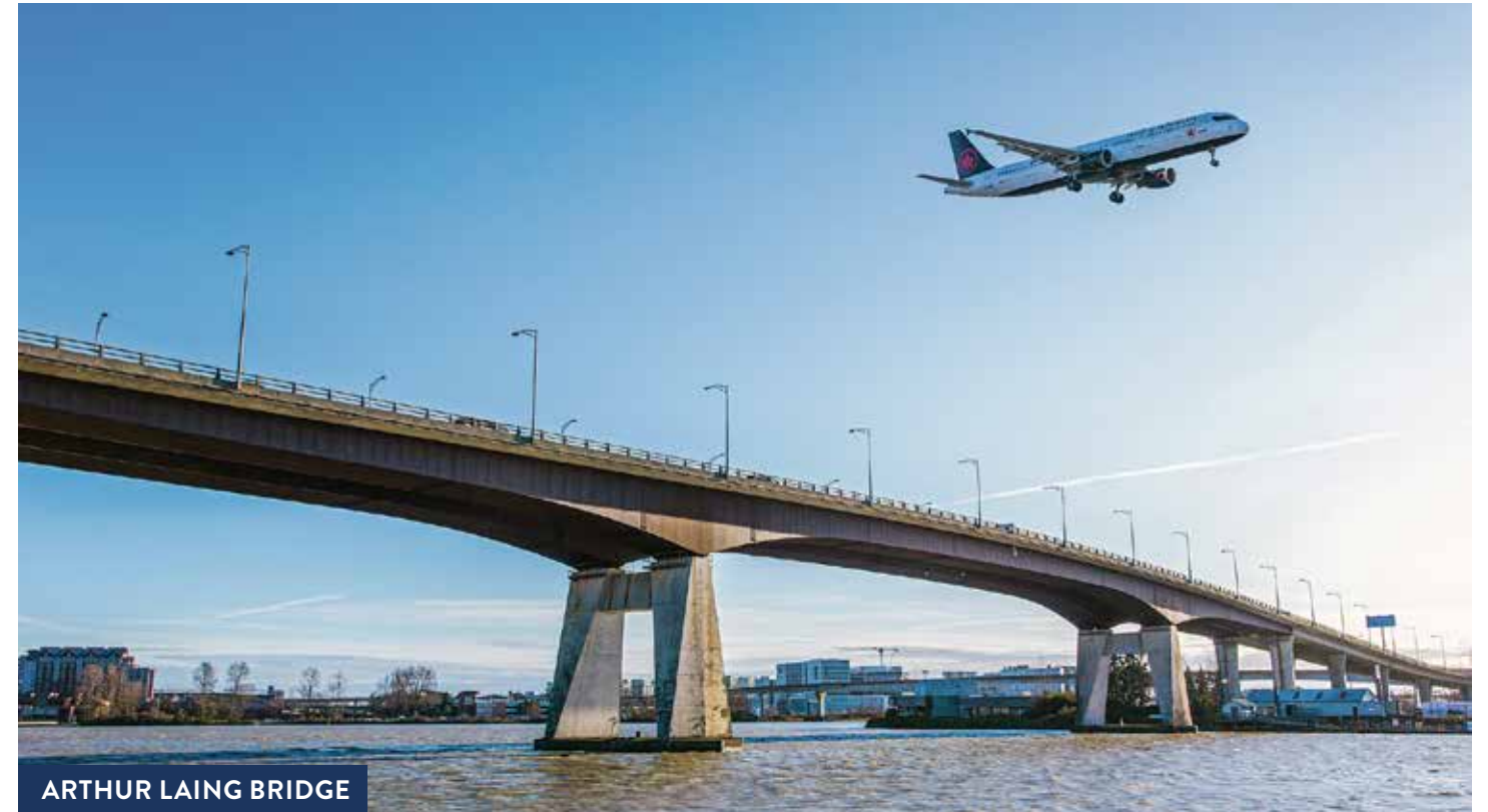
ARTHUR LAING BRIDGE