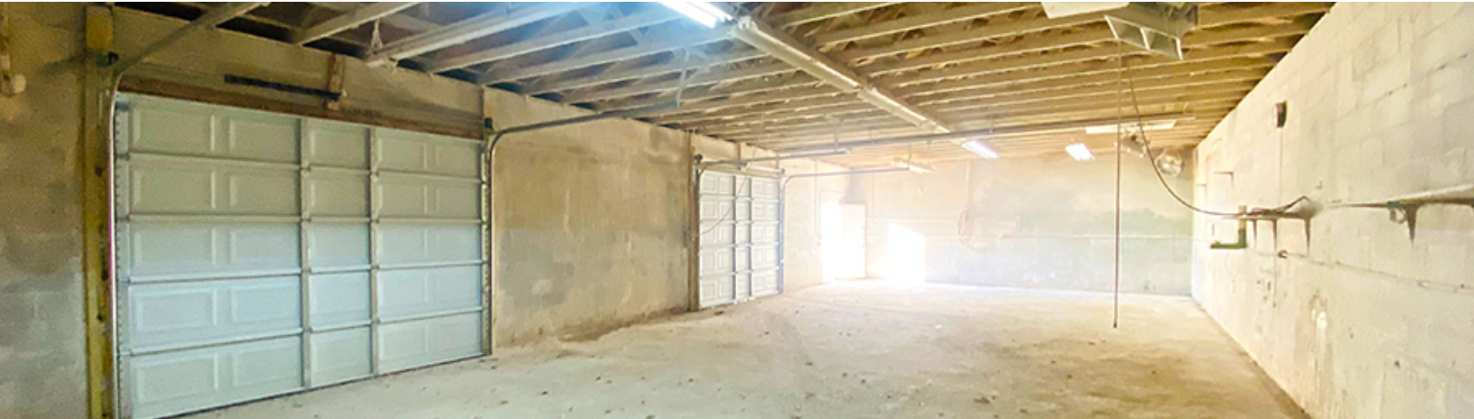
Building B Interior