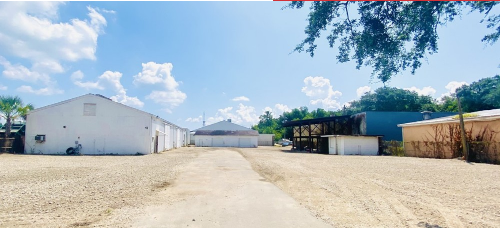
Building A - 5,000 SF & Building B - 2,000 SF