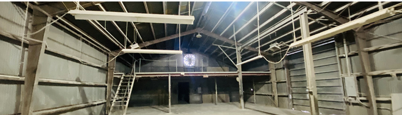
Build A Interior