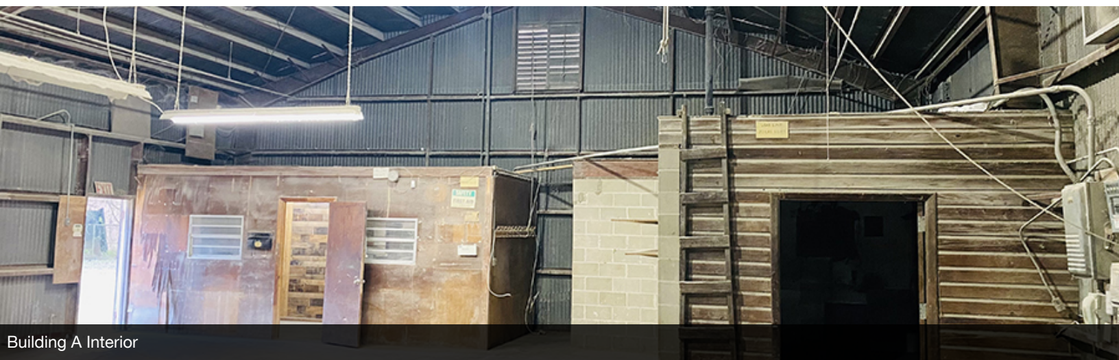
Building A Interior

NO WARRANTY OR REPRESENTATION, EXPRESS OR IMPLIED, IS MADE AS TO THE ACCURACY OF THE INFORMATION CONTAINED HEREIN, AND THE SAME IS SUBMITTED SUBJECT TO ERRORS, OMISSIONS, CHANGE OF PRICE, RENTAL OR OTHER CONDITIONS, PRIOR SALE, LEASE OR FINANCING, OR WITHDRAWAL WITHOUT NOTICE, AND OF ANY SPECIAL LISTING CONDITIONS IMPOSED BY OUR PRINCIPALS NO WARRANTIES OR REPRESENTATIONS ARE MADE AS TO THE CONDITION OF THE PROPERTY OR ANY HAZARDS CONTAINED THEREIN ARE ANY TO BE IMPLIED.