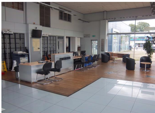
Photographs taken August 2017 following removal of franchises and all corporate branding