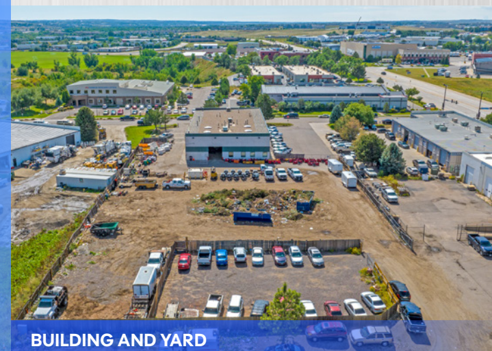
BUILDING AND YARD