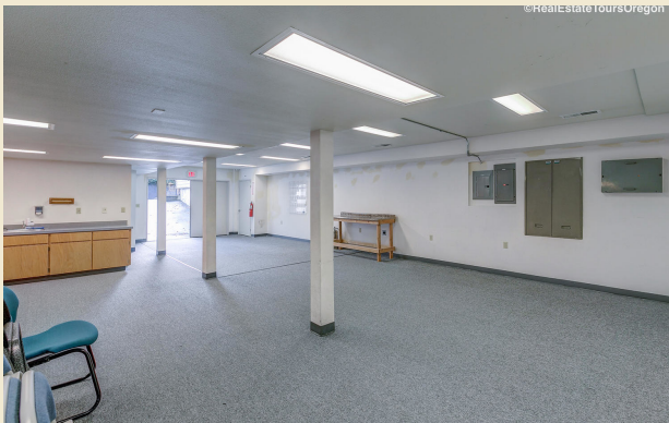
Suite C (Bsmt)