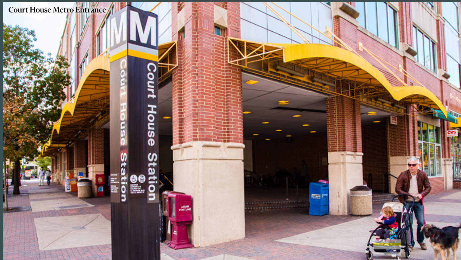
Court House Metro Entrance

Court House Metro Station | 1 min (344 ft)