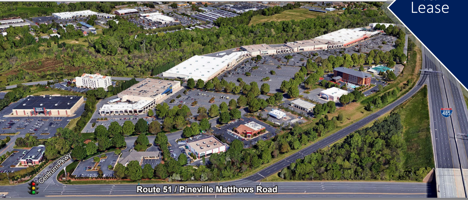
Route 51 / Pineville Matthews Road