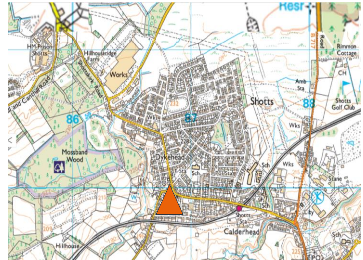
The location map above is for illustrative purposes only.

For further information or viewing arrangements please contact the sole agents: